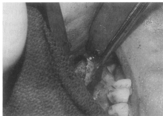
Fig. 2. Cancellous bone is rigidly stabilized with titanium screw.